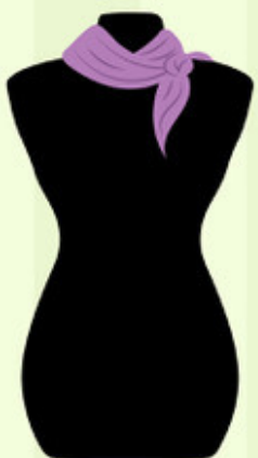
OVER SHOULDER KNOT