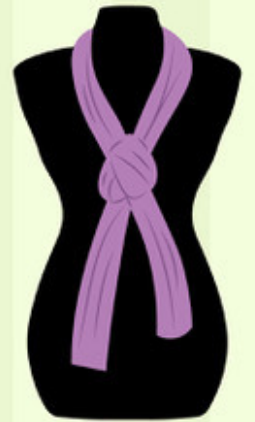
FIGURE 4 KNOT