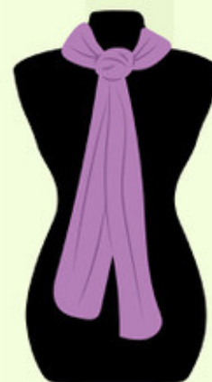
TWIST & LOOP