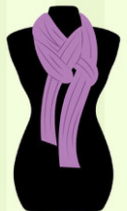
TWISTED LATTICE TUCK